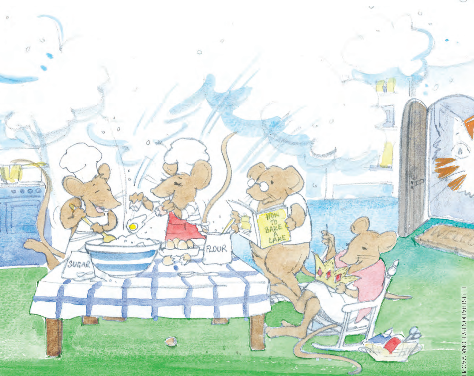
ILLUSTRATION BY FIONA MACPHERSON

A Wizard Presents, Orange Tree Theatre and Little Angel Theatre co-production